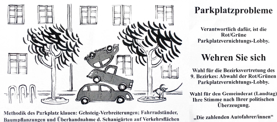
Fig. 4: Original handout by the “Motorist Lobby” during the election of the municipal council Vienna, in Oct. 2010

In order to develop a sustainable solution to the transit problems that plague the Gründerzeit street level environment, it will be necessary to employ a systems-oriented view of mass mobility. Such a view will take into consideration causes, effects, benefits, and costs as well as consequential costs, resulting in a factual analysis of systemic interrelations and a suitable spectrum of key measures identified.