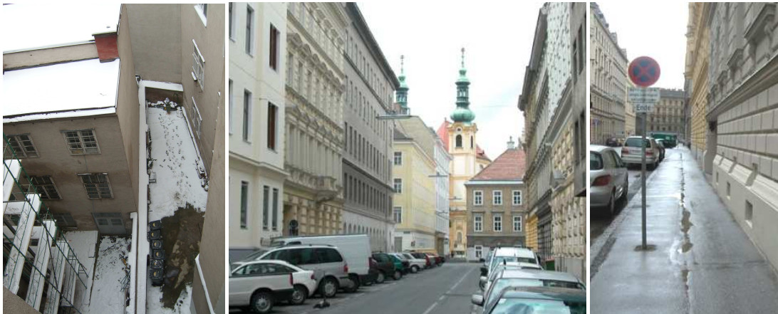
Fig. 3: obstructed inner courtyard - street profile in a Viennese Gründerzeit quarter – narrow sidewalk.

The structural point of departure for use-intensification of the Gründerzeit ground level is in fact particularly disadvantageous. The street-level space created during the Gründerzeit period is dense and receives little daylight. The construction regulations in force at the time provided for roadways five or eight fathoms wide; from 1870 on the requirement was 16 and 12 meters respectively. Consequently, the average width of today's streets is between nine and 16 meters, which in relation to the building height of 24 meters is extremely narrow. Measuring 30 to 35 meters across, Berlin's residential streets are two to three times as wide. As a result, the daylight supply to Vienna's lower levels is relatively scarce. The situation is even worse in the interior courtyards, with light wells and airshafts at minimal size. Additionally, the surface area of the courtyards are often fully built-up or sealed, a circumstance that adds to a detrimental microclimate.