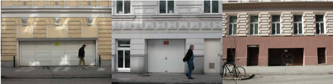
Fig. 2: small garages, and basement entryways

However, land use conflicts that one might expect from this imbalance do not actively arise; instead, there exists an a-priori assumption in favor of a medium that from a social science point of view is elitist, benefiting only part of Vienna's population while paid for by everyone and requiring substantial public subsidies. 4 The average car owner covers only 40 % of the costs he or she causes. This is the conclusion of a comprehensive cost analysis carried out by Gerd Sammer, which includes all the consequential impacts of car use including noise, harm caused by exhaust fumes, public health impact, greenhouse effect, CO 2 emissions, etc. (compare: Sammer, 2007).