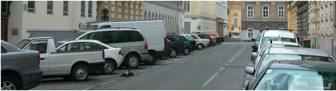
Fig. 1: Street filled with parking spaces