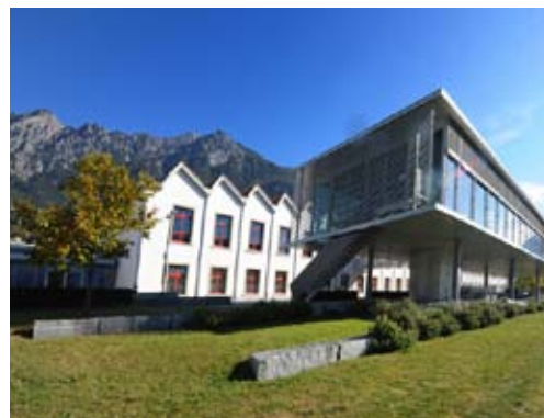
Real campus atmosphere: Green Summit 2014 in Liechtenstein

from other European countries as well came together at the relatively small, but by its content excellent event. The congress has been founded in 2008, at first as a biannual event. In 2013 the Faculty of Architecture and Civil Engineering celebrated its 50th anniversary—a reason to break the biannual frequency, so that since 2012 the Green Summit took place annually. If this annual frequency will establish is still an open question, but if not next year, then latest in 2016 the Green Summit will take place in Liechtenstein again.