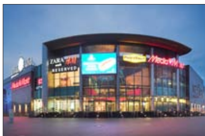
CBRE European Shopping Centre Fund has added to its portfolio wGaleria Mazovia in the Polish city of Płock.