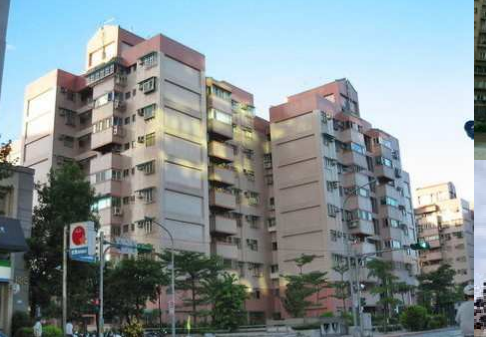
lots of gain from it.