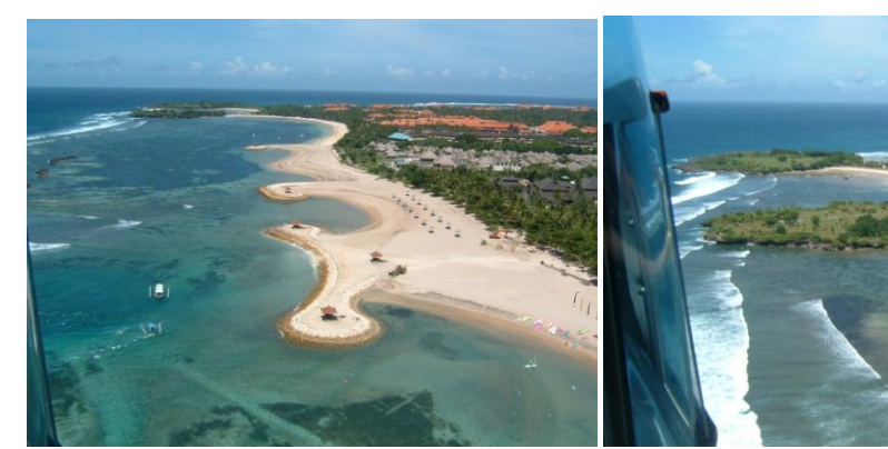
Figure 5: Nusa Dua's aerial photo with artificial reefs as Groins after Project (BBCP, 2006). Figure 6: Two small islands as an identity of Nusa Dua Resort (BBCP, 2006)

From the first step, Nusa Dua was designed as an enclave tourist resort and private resort to avoid the negative impacts of tourism to local culture and community. This private resort was approved by the province and central government. This is because the rationale was good and reasonable; however it means that there was contradiction from the notion of Balinese Hindu Society, and also disagreement from the National Policy in which the beach is sacred and public area (Figure 5). Though an access to two temples which located at the two small islands has been available, the nuance and atmosphere for preparing ritual rites at the temples is strictly different (Figure 6). Because of this sample, the beaches at the northern and southern side of Nusa Dua resort tend to be private, even the beaches at Geger Beach. At those locations, hotel operators use the beaches in front of their property as much as possible, backed up by their security guards.