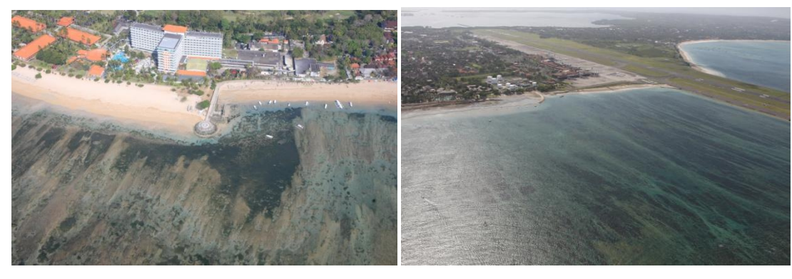
Figure 1: Bali Beach Hotel's waste water treatment tank at shoreline – offshore (BBCP, 2006). Figure 2: International Airport's runway with cross structure by approx. 800 metre (BBCP, 2008)

From the beginning, the increasing growth of tourism in Bali produced a positive outcome with the opening of Bali Beach Hotel (recent name: The Inna Grand Bali Beach Hotel) in 1966 and Ngurah Rai International Airport in 1967. Both facilities are located at Sanur and Tuban/Kuta Beach. Although both facilities had negative impacts on the coastal environment, such as Bali Beach Hotel constructed its waste water treatment tank at offshore (Figure 1) and the International Airport constructed their runway crossing shoreline by approximately 800 meter (Figure 2). It seemed that Bali had been proclaimed as the centre of tourism in Indonesia and expected tourist coming to Bali could spread to other regions in Indonesia.[11] Since then, the development of coastal tourism resorts at Sanur and Kuta had grown without planning and coordination. The unplanned and uncontrolled tourism resorts indicated by lack of infrastructure especially access to the beach, lack of public facilities, worse sewerage system, discharging water disposal to the sea, building frontier offences, and others had led to a high building density and threats of environmental disaster.