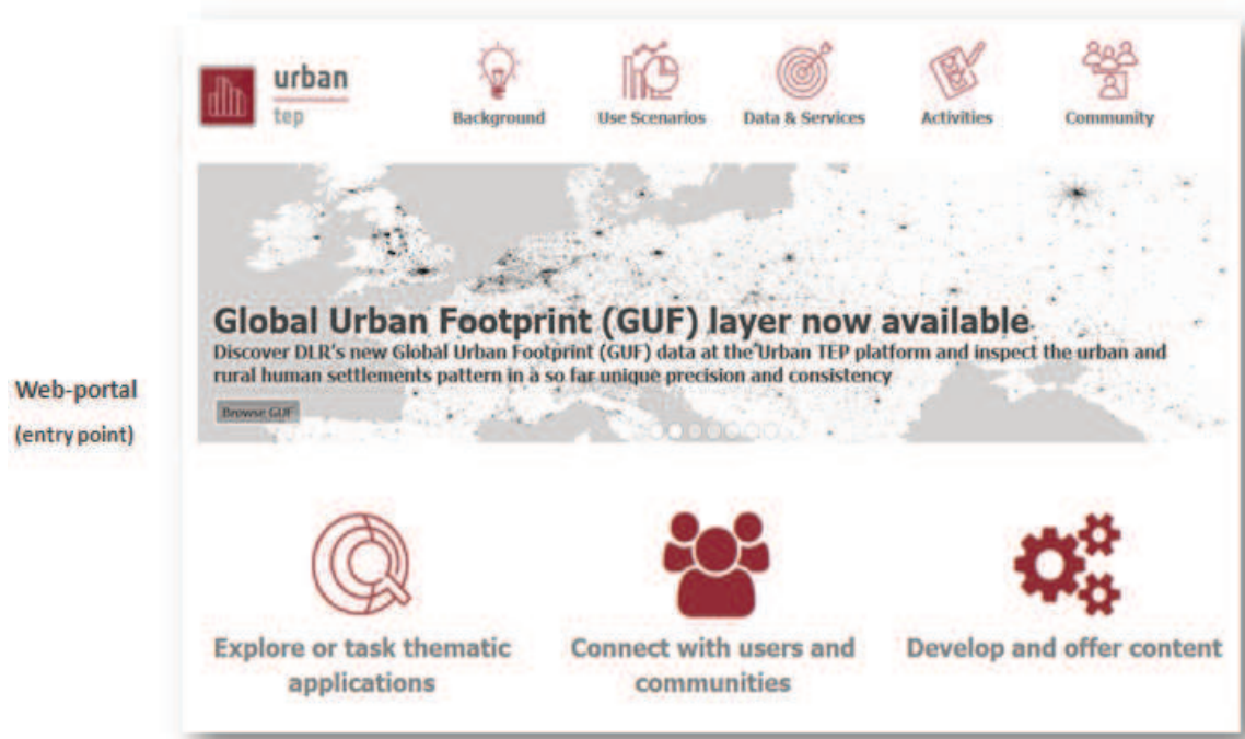
Fig. 1: U-TEP web-portal ( https://urban-tep.eo.esa.int ) serving as entry point to the system.

It is important to mention that the U-TEP platform is not designed to access EO data directly, and therefore, does not perform as a classical data distribution tool.