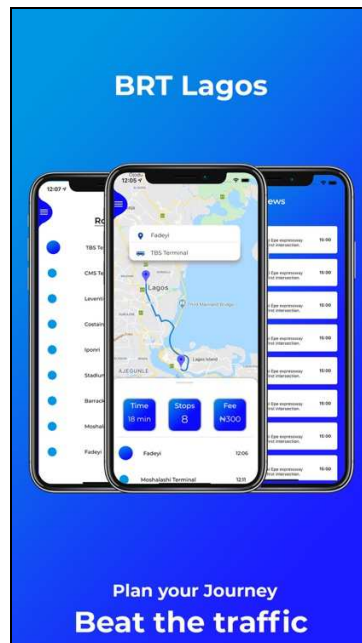
Figure 9: BRT Lagos app

was reported that not all buses had active card validators, many of the terminal points did not have card recharging services, passengers were being overcharged on trips and validators being switched off by drivers as paper tickets made more money (Popoola 2015).