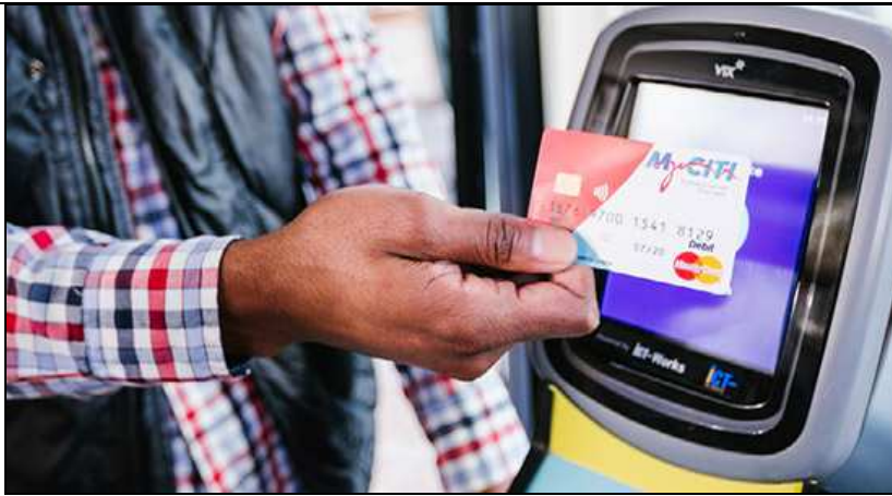
Figure 6: MyConnect card being tapped aboard MyCiti BRT

Cape Town has three active ICT mobile applications that provide public transport users with schedules which are essential to trip planning. The three apps are ‘GoMetro app’, ‘TCT app’ and the ‘iOSMyCiti app’ which is not an official one.