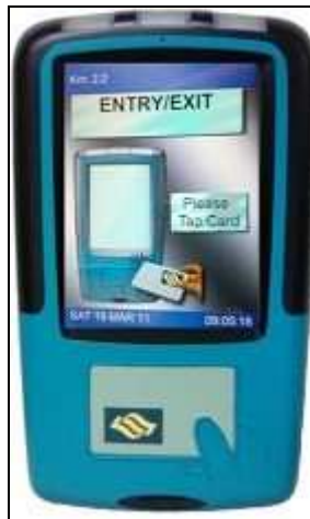
Figure 2: EZ-Link card reader

Users of public transport in Singapore can make use of two modes of payment, one in the form of a contactless smart card and the other is mobile payment approaches (Wolniak and Grebski 2023). Singapore's electronic ticketing system is the EZ-Link card (Zhu 2020). The EZ-Link card was first introduced in Singapore in April 2002. The card allows public transport users to pay for different modes of transport creating a more integrated system as well as an easy and efficient payment method (Wolniak and Grebski 2023). It is important to note that the EZ-Link card can also be used for other payments such as some retail purchases, tolls and parking. The fares of the card are dependent on the distance travelled, the age demographic of users giving a cheaper rate to seniors, students and children (Chakirov and Erath 2011).