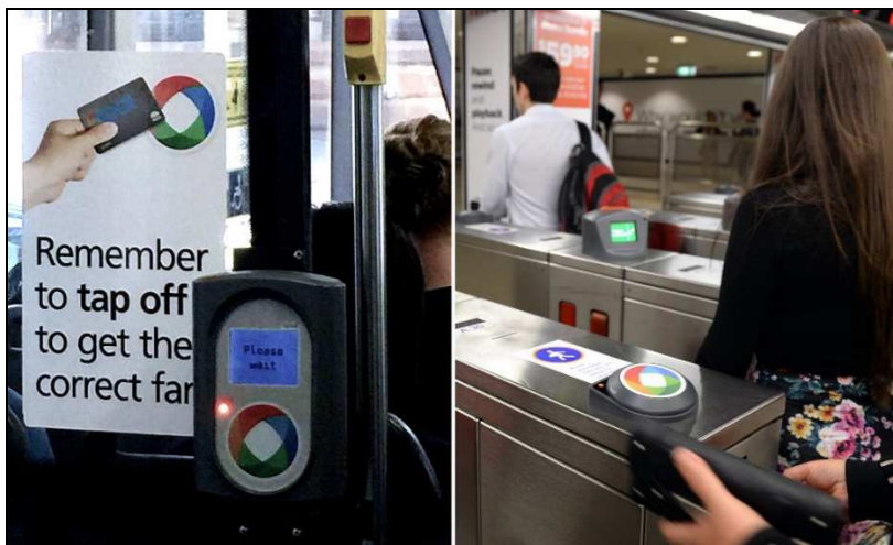
Figure 4: Sydney’s Opal card for public transport payments

Sydney has adopted an electronic ticketing system in the form of a smartcard for public transport. The smartcard is called the Opal card, which replaced the previously used paper tickets. The Opal card was introduced between 2013 and 2014 in a step-by-step method (Ellison et al. 2017). The Opal card provides an integrated transport system as the card can be used on different public transport modes, which are; bus, train, light rail and ferry (Qu 2022). Though the Opal card itself provides contactless payments, Opal card readers also allow contactless payments from Visa debit and credit cards, Mastercards and American Express cards (Sydney.com 2023). There are six different Opal cards; adult, child/youth, gold, concession, school and free opal cards. Each card has a different has a different fare with the adult Opal card paying the highest fares.