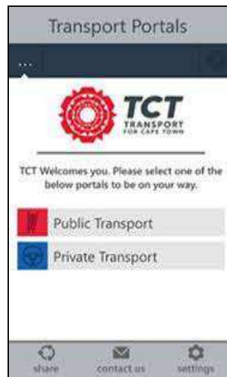
Figure 7: Transport for Cape Town (TCT) app

Cape Town has three active ICT mobile applications that provide public transport users with schedules which are essential to trip planning. The three apps are ‘GoMetro app’, ‘TCT app’ and the ‘iOSMyCiti app’ which is not an official one.