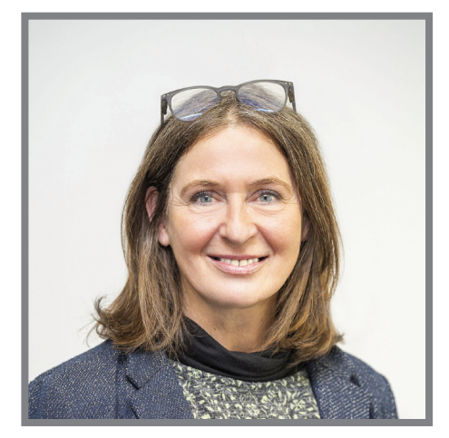
Elke Kahr, Graz, Austria Mayor of the City of Graz