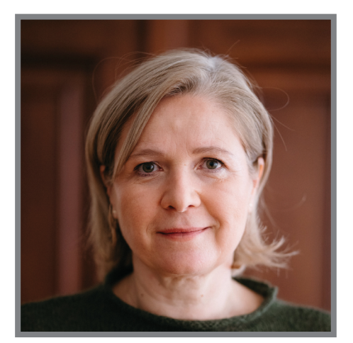
Judith Schwentner, Graz, Austria; Deputy Mayor of the City of Graz